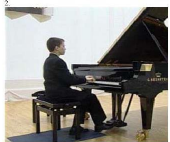
<u>2 question:</u> Study the advertisement.